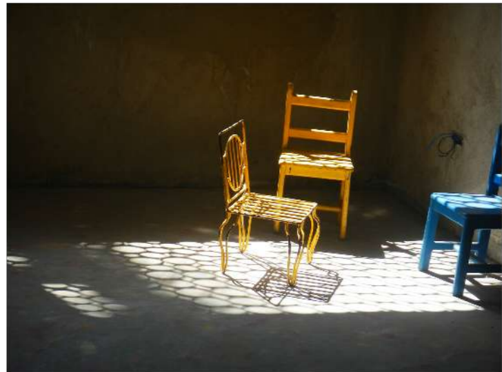
Play of lights