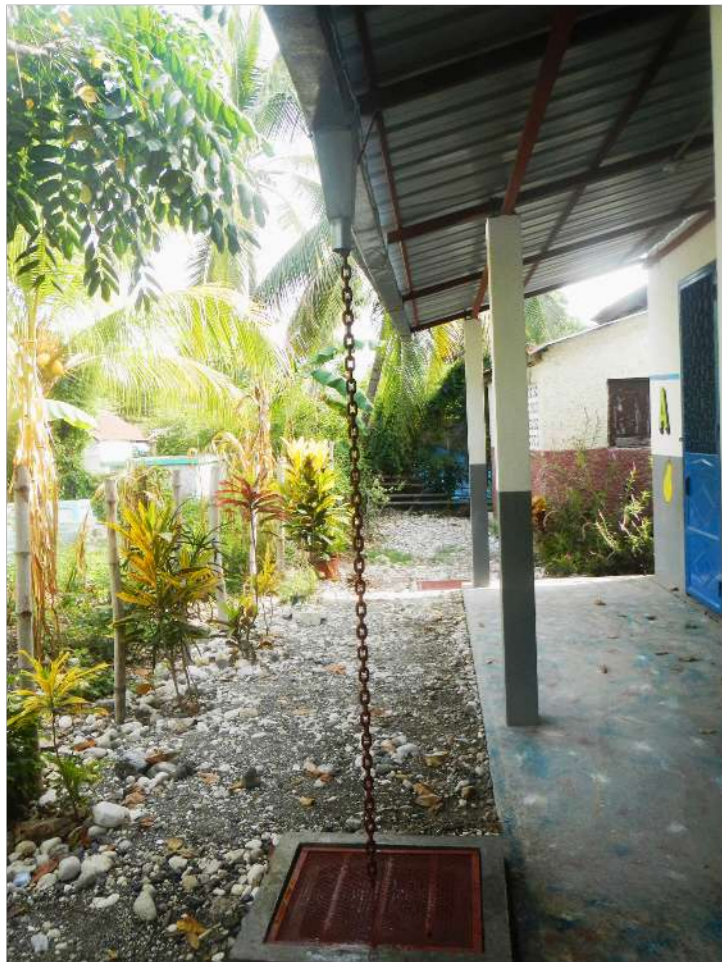
Rain waters collector